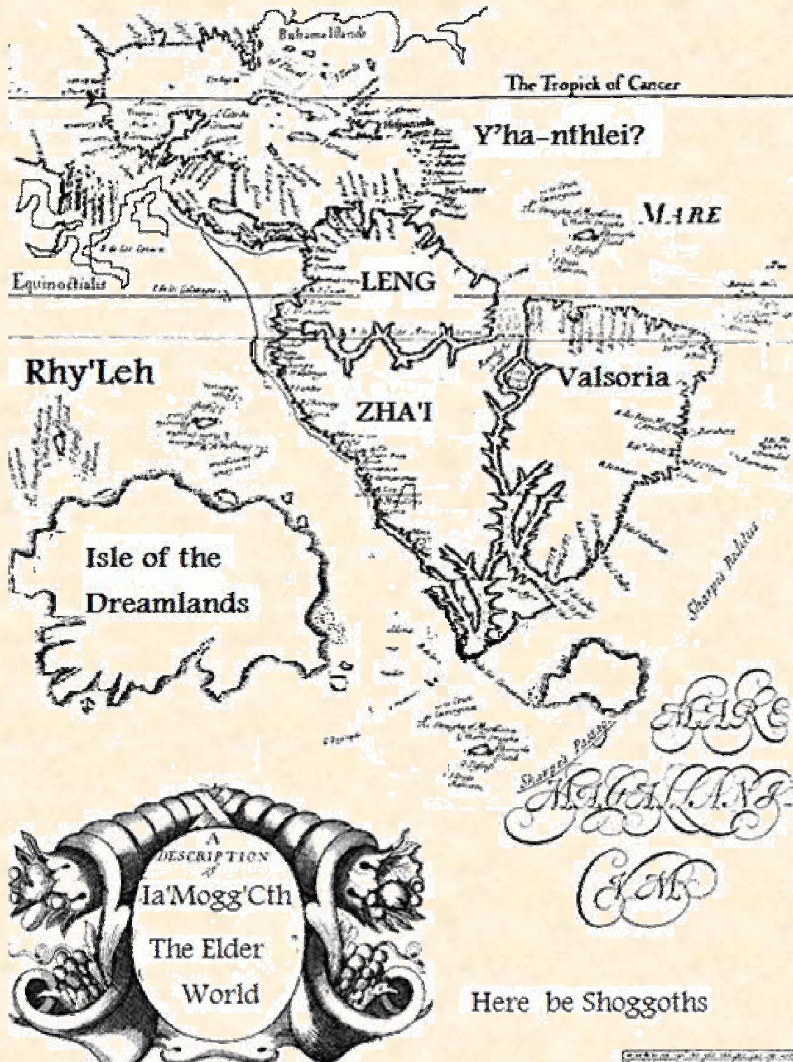
A Map of the Elder World, 1666 A.D.